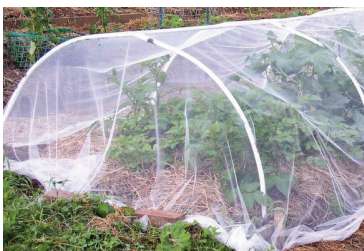
Row covers keep snails out.